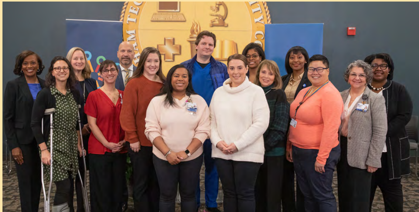
Members of the Duke University, Duke Health, Durham Technical Community College, and Durham Public Schools at the partnership announcement.

With our philanthropic partners, we advance projects and programs with the highest potential to transform people's health no matter where they live.