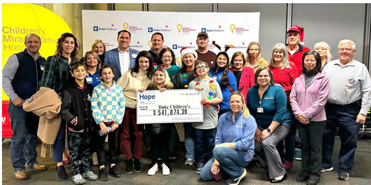
Duke Children's Season of Hope Radiothon